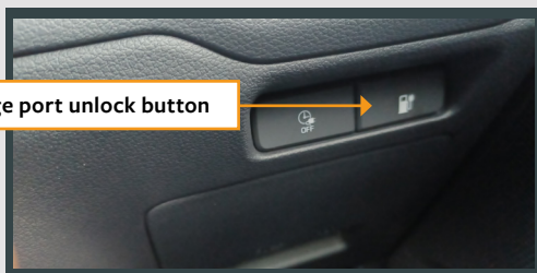
Charge port unlock button