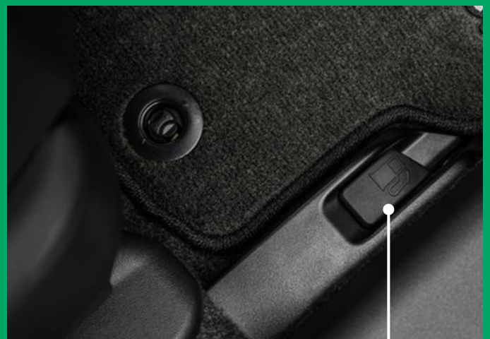
Fuel release lever

The release lever for the fuel cap is located in the right side of the driver's footwell. By pulling the lever up it will release the fuel filler door.