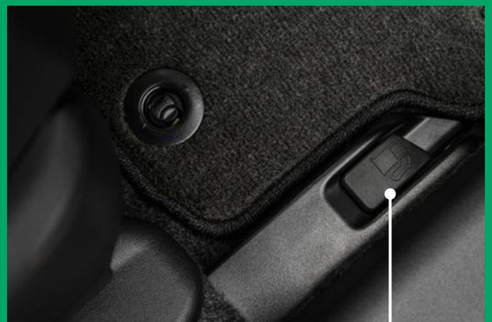
Fuel release lever

The release lever for the fuel cap is located in the right side of the driver's footwell. By pulling the lever up it will release the fuel filler door.